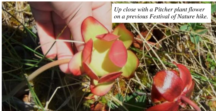
Up close with a Pitcher plant flower on a previous Festival of Nature hike.

The wait is over! Registration for the 2012 Door County Festival of Nature is now open. This year's Festival will be held on May 18 & 19 and features almost 50 field trips and workshops.