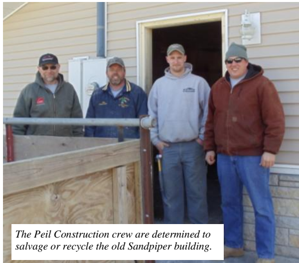
The Peil Construction crew are determined to salvage or recycle the old Sandpiper building.

Plans for the new handicapped accessible boardwalk are also under development. Meetings are in process with the Departments of Natural Resources and Fish & Wildlife regarding placement of the boardwalk to protect the Dwarf lake iris and Hine's Emerald dragonfly. In addition, we're working with the county to ensure compliance with the Americans with Disabilities Act. Construction will begin this summer, assuming funding is in place. When completed, the boardwalk will be accessed from the northern edge of the site. We still need cedar logs – 8" in diameter, 8 ft. long. Call us at 920-839-2802 if you have