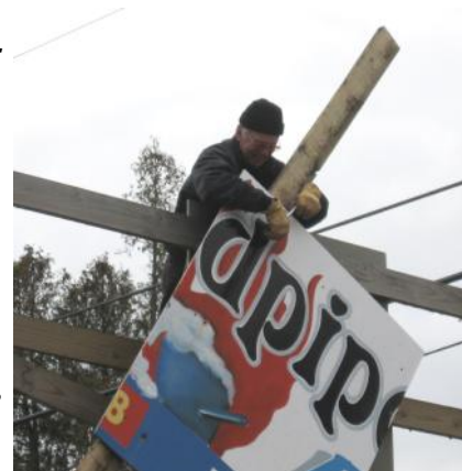
Wednesday Crew member Peter Classen takes the Sandpiper sign down from the Ridges latest property acquisition that will safeguard the watershed and be a site for the new information center

With the acquisition of the Sandpiper property behind us, we're ready to move on to the next phase of the campaign. In the coming year, we'll be focusing on detailed designs for the new building, site preparation, the trail systems and the restoration of the Lower Range Light.