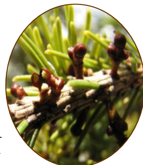
The dwarf mistletoe is the first plant to flower each year—watch for it in late March

Learn more on any of these items at http://RidgesSanctuary.org