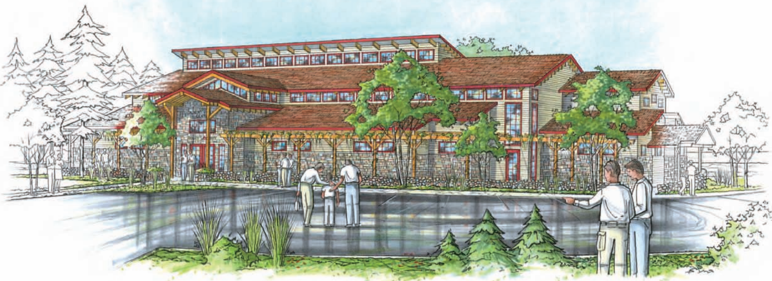
COOK ALBERT FULLER CENTER

Following the ceremony at the site, attendees are invited to join us for refreshments at the Baileys Harbor Town Hall.