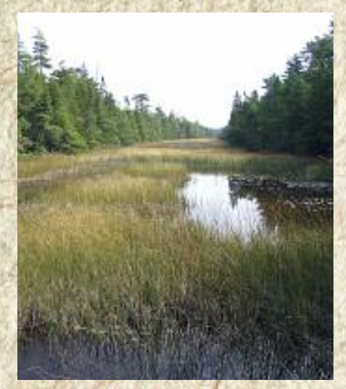
RIDGES LITES Fall 2014, Vol. 7 Issue 4

NON-PROFIT ORG. U.S. POSTAGE PAID BAILEYS HARBOR, WI PERMIT NO. 1