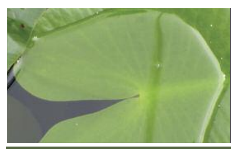
For complete program info, visit RidgesSantuary.org

$10 – Members • $13 – Public • $5 – Children under 18