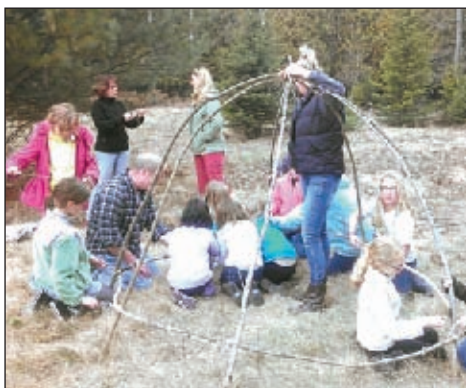
Wigwam Bird Blind