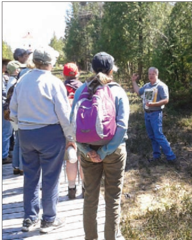
Festival of Nature Hike

Our camp programs have undergone a total makeover and are designed to provide your child with a safe, fun-filled experience in the outdoors. See the enclosed flyer for details and then register at RidgesSanctuary.org or call 920-839-2802.