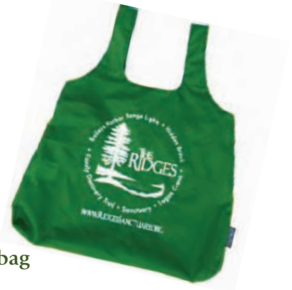
Reusable ChicoBag shopping bag