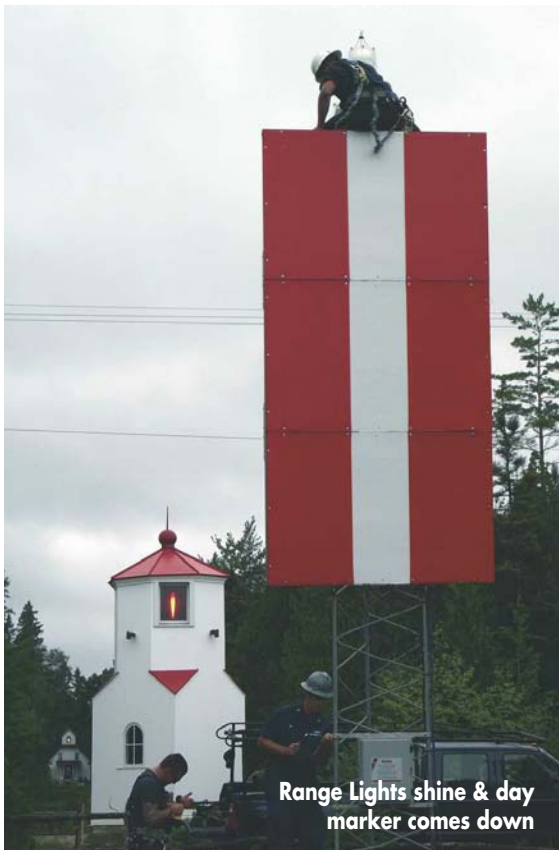
Range Lights shine & day marker comes down