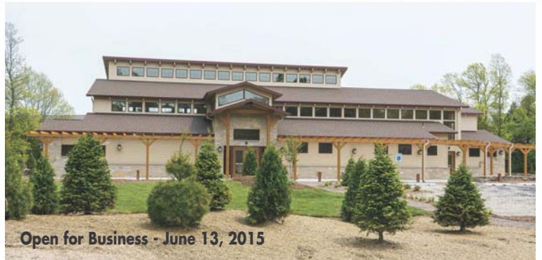
Open for Business - June 13, 2015