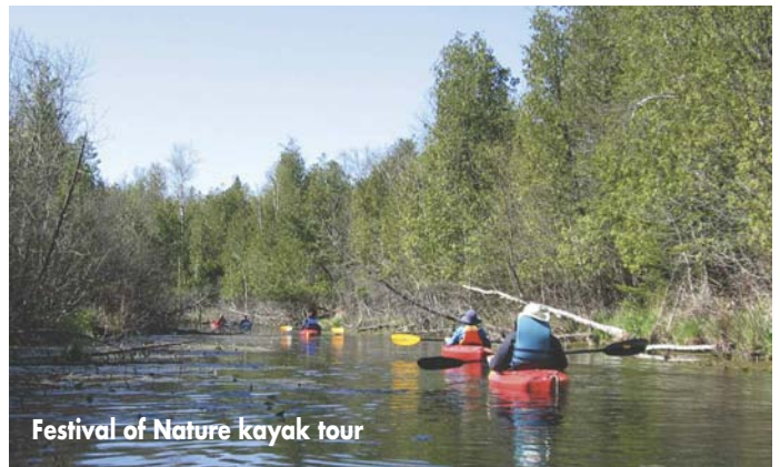
Festival of Nature kayak tour