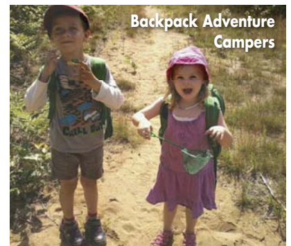
Backpack Adventure Campers