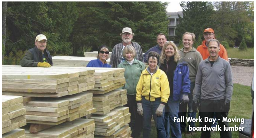
Fall Work Day - Moving boardwalk lumber