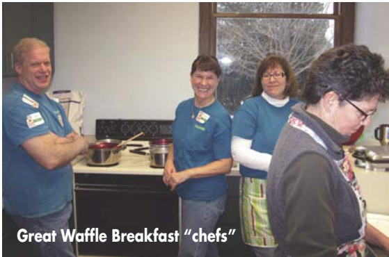
Great Waffle Breakfast "chefs"