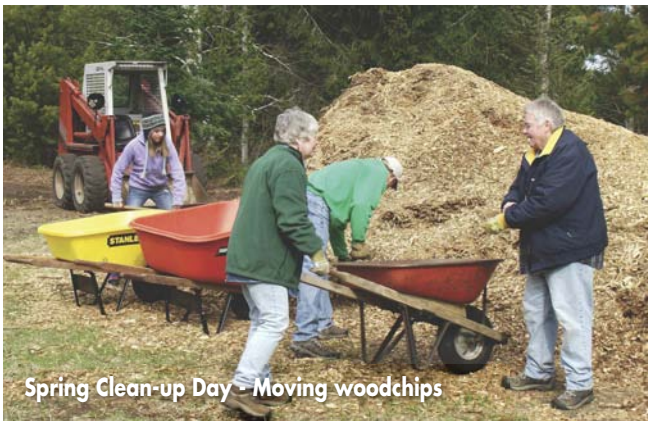
Spring Clean-up Day - Moving woodchips