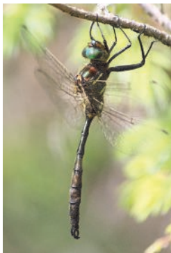
A male Hine's emerald dragonfly

The Hine's emerald dragonfly was first discovered in Door County in 1987 and there are only a few places in the country where it survives and breeds. Studying its life and numbers is an important part of keeping these Federally endangered populations viable.