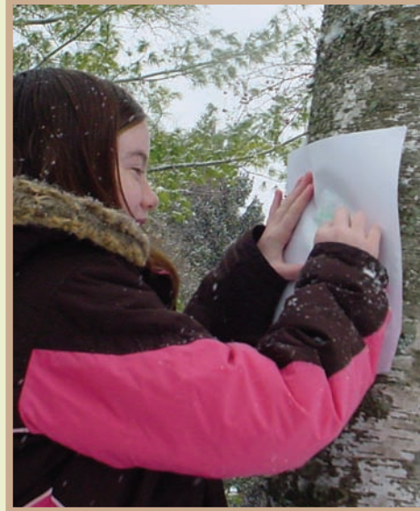
A bark rubbing can be added to your tree diary using a crayon and a piece of plain paper.