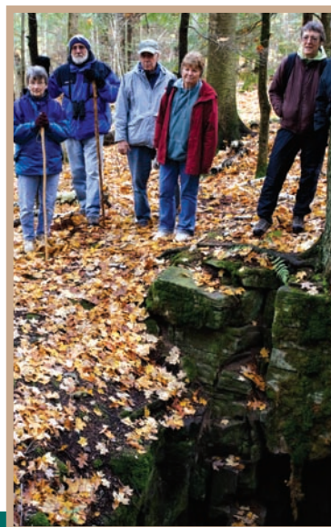
Learning about a karst feature at the Land Trust’s Lautenbach Woods near Egg Harbor.