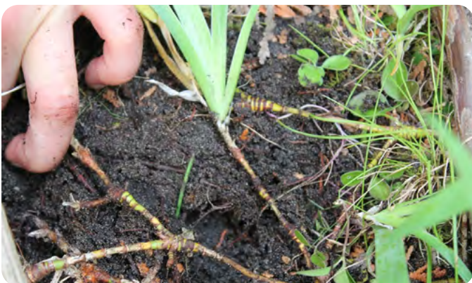
Dwarf Lake Iris Transplant