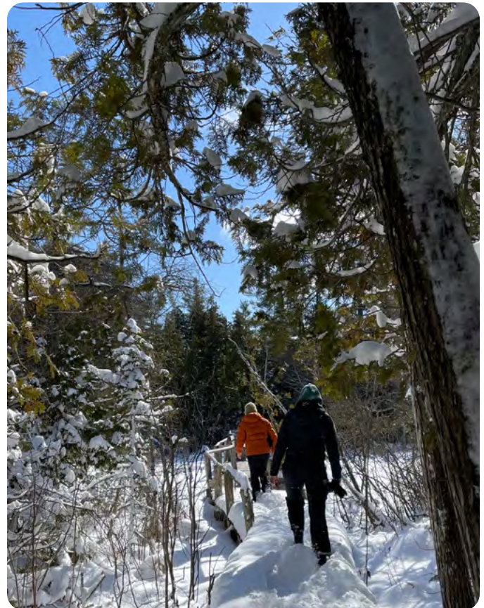
Winter Guided Hikes

Meet: Cabins at The Ridges Sanctuary, 8288 Cty. Q, Baileys Harbor, WI