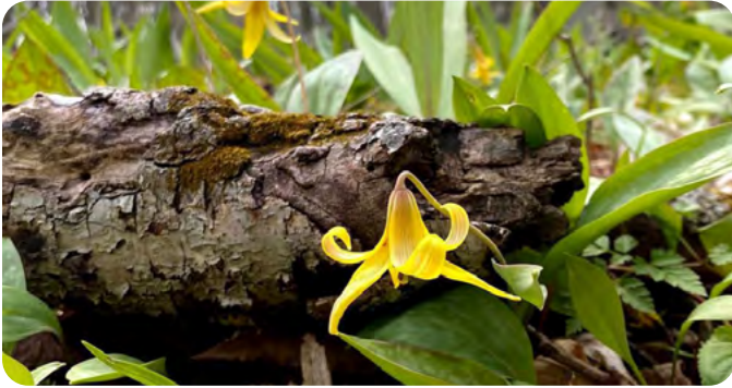
Trout Lily, Logan Creek