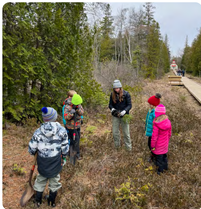
Forest School, Tree Transplanting

To register for programs, visit RidgesSanctuary.org or call (920) 839-2802