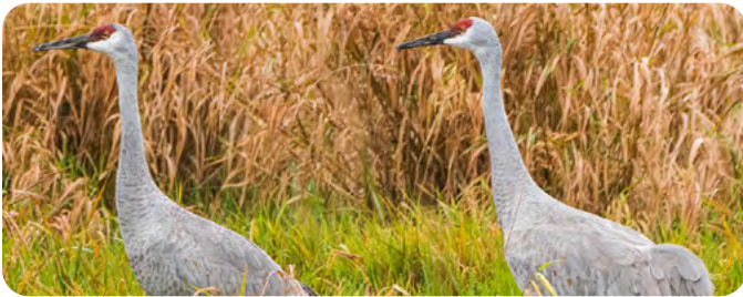
Sandhill Cranes

Location: Cook-Albert Fuller Nature Center