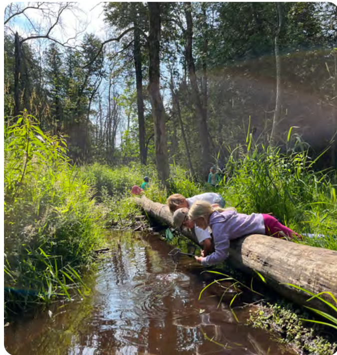
Summer Camp, Stream Exploration

Registration for Backpack Adventure Camp opens on Monday March 4th!