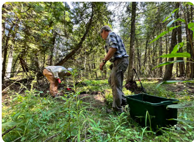
Dwarf Lake Iris Transplant